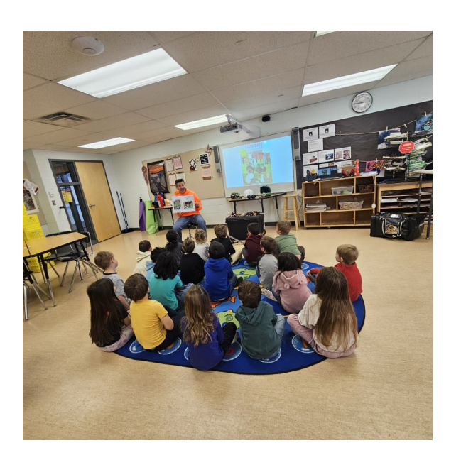
Farm Safety presentations