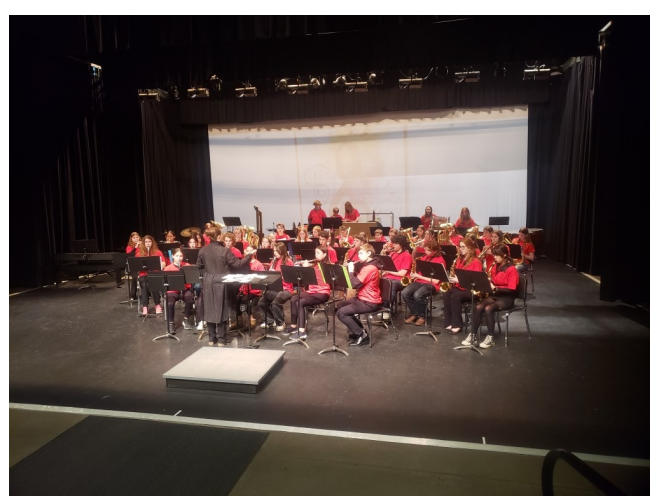
2025 Kiwanis Festival Olds Gr 7 Band Gr 8 Band Gr 4&5 Choir