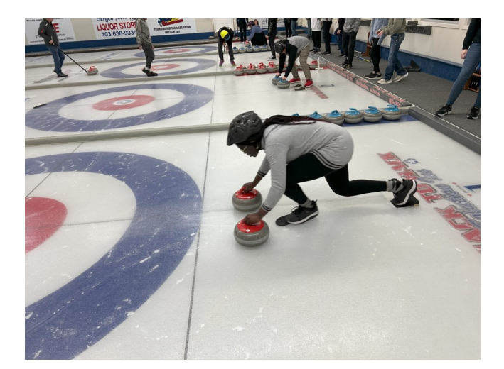
Gr 7 Curling